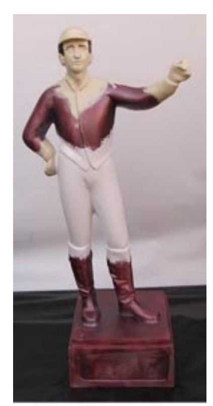
Day 3-5: 2 coats almond Day 7-9: 2 coats white and leather brown