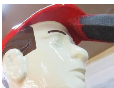
Pro-tip: Paint lines with 1" foam brush