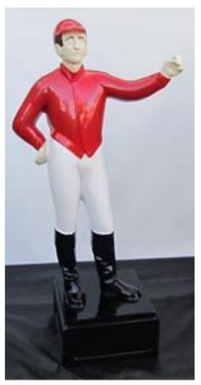
Day 11: 1 coat red then 1 coat black. Day 13: 1 coat red then 1 coat black.