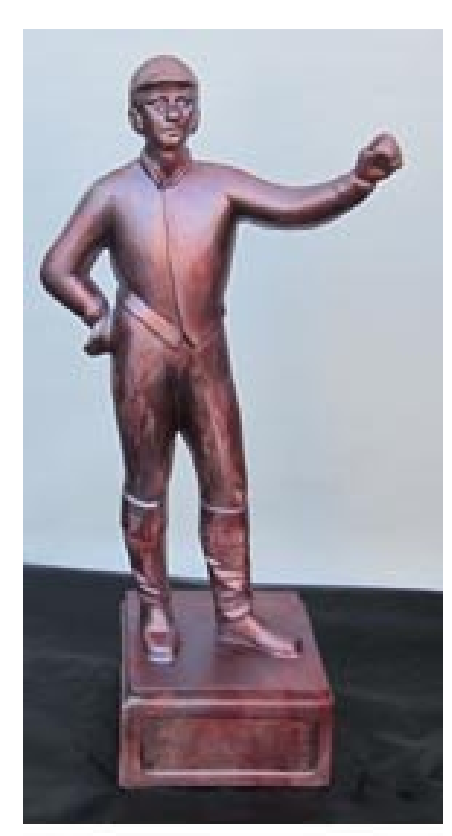
Day 1 - Prime & let dry 2 days